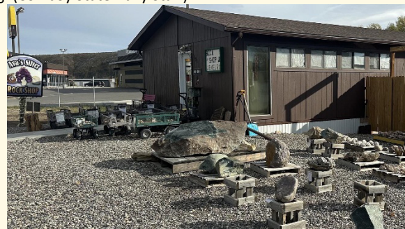
Ava's Silver and Rock Shop is located in Thermopolis, Wyoming.