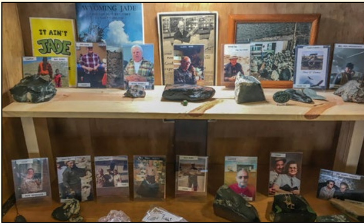
Natrona County Rockhounds' showcase, 'Rockin' Wyoming Jade.'