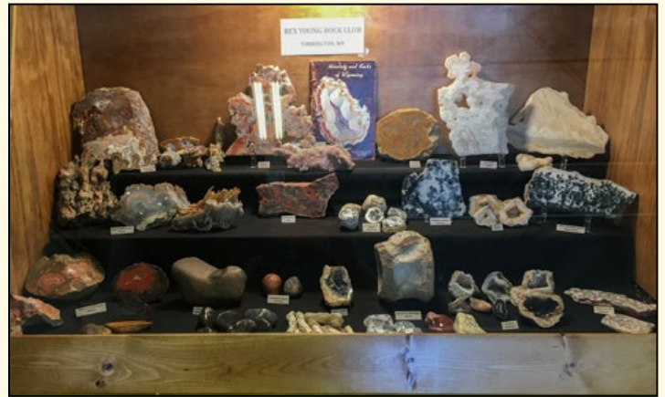
Rex Young Rock Club's showcase, Torrington, Wyoming.