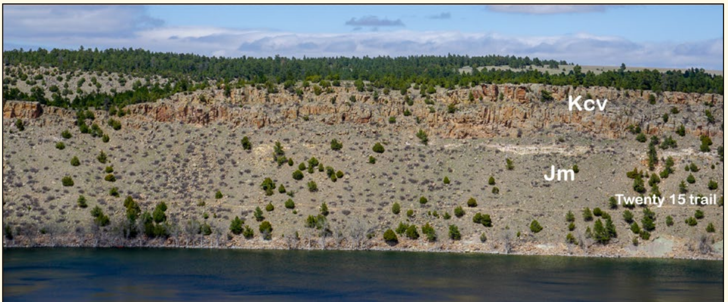
Tan sandstone beds of the Cloverly Formation (Kcv) form cliffs that top many hillsides and ridges in the southern portion of the park. Beneath the Cloverly are slope-forming mudstones and thin sandstone beds of the Morrison Formation (Jm). The Twenty 15 trail can be seen cutting across the lower part of the hillside.

This system is an important source of agricultural water in these states. Cheyenne, Wheatland, Pine Bluffs, and many other Wyoming communities also use High Plains aquifers as municipal water sources. The town of Glendo gets its municipal water supply from wells in the Hartville Formation, while Glendo State Park sources its water from the White River and Cloverly formations.