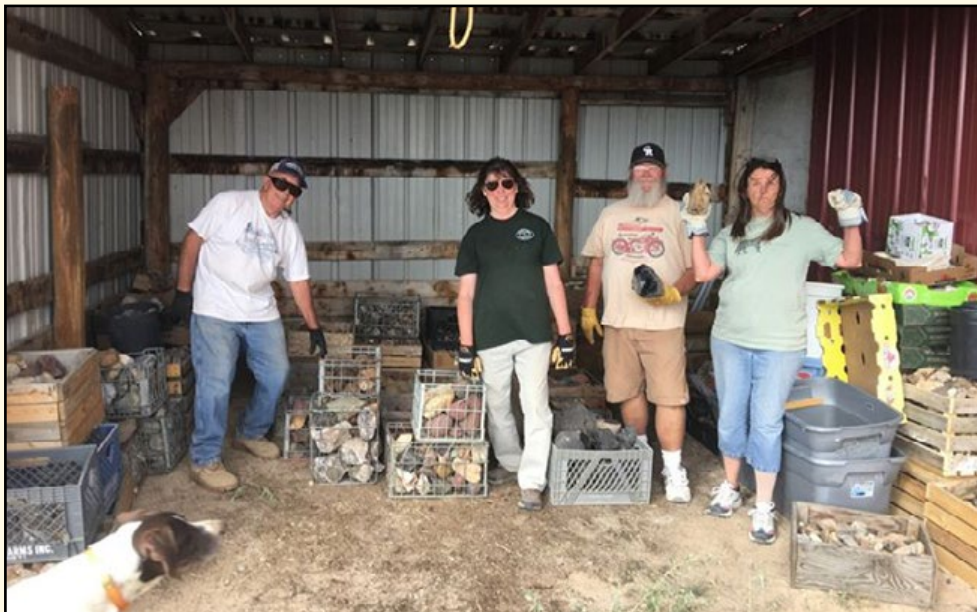
Club rock moving day for the Cody 59ers.