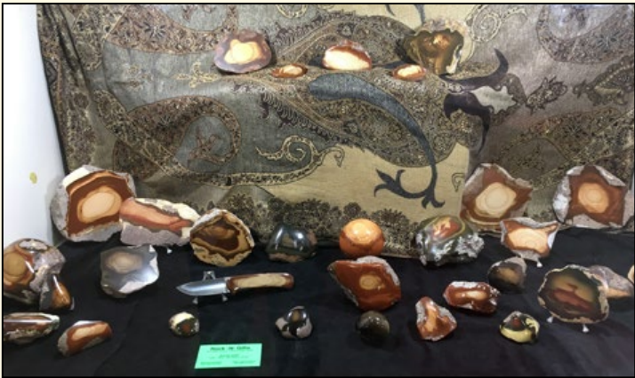
Talbot showcase #3 — Bruneau Jasper; honorable mention.