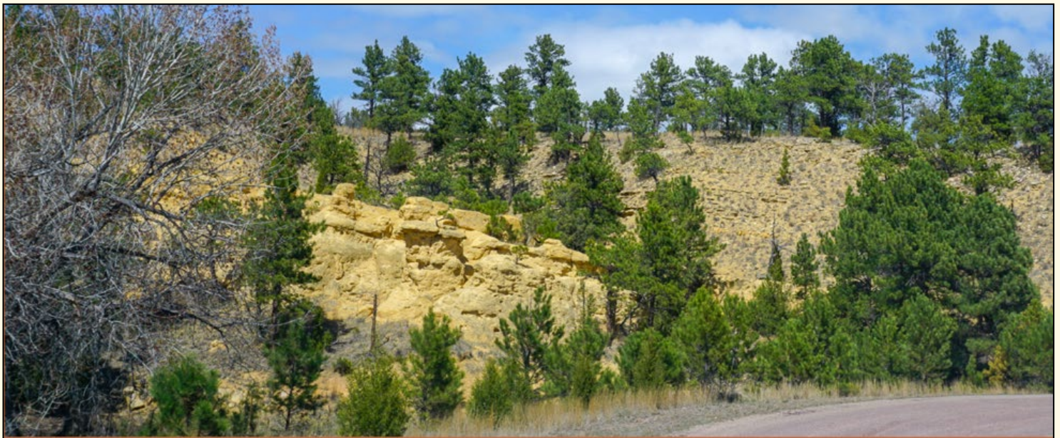
Yellow sandstone (resistant blocks in foreground) and mudstones (slope in the background) of the Jurassic Sundance Formation.(slope in the background) of the Jurassic Sundance Formation.

One of the structures formed by the Laramide orogeny is the Hartville Uplift, a large northeast-trending arch-shaped fold, known as an anticline, which is located between the Laramie Mountains and the Black Hills. Glendo State Park is situated along the northwestern edge of the Hartville Uplift.