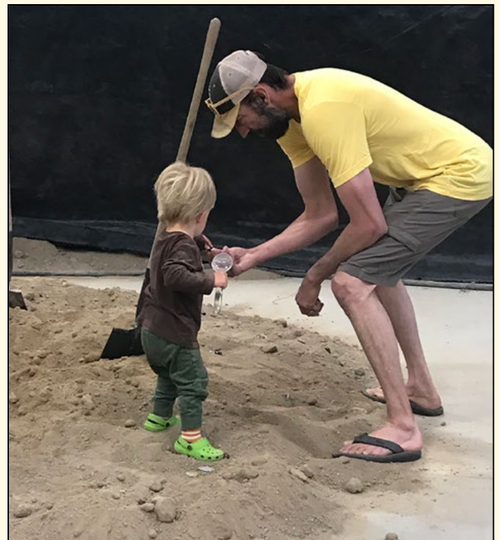
'Real kids' had lots of fun with activities for children at the annual Wyoming State Gem and Mineral Show show in Pinedale.