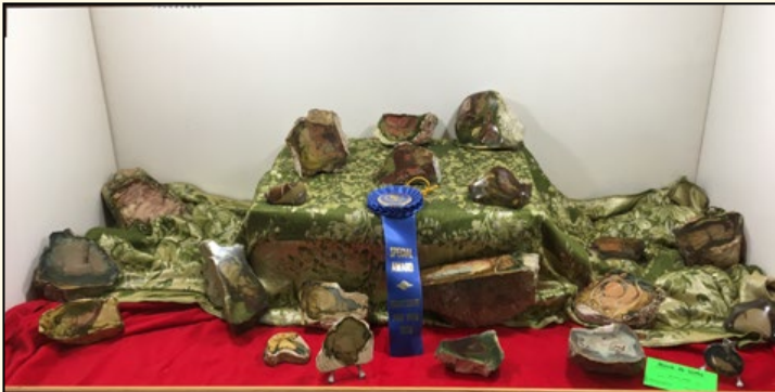
Talbot showcase #1 — Bruneau Jasper, Morrisonite; honorable mention.