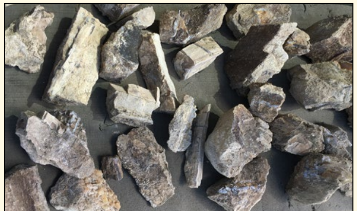
Rock show attendees were able to hunt rocks, such as this Blue Forest petrified wood, during group field trips.