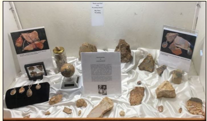
Talbot showcase #4 — Tigillites Bohmei by Claude Brongnaugh; honorable mention.

Dealers display their wares as customers shop at the 2020 Wyoming State Gem and Mineral Show at Big Piney, Wyoming, in June.