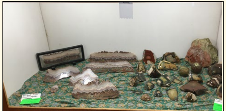
Talbot showcase #2 — Prudent Man Plume Agate and Morrisonite Jasper from Oregon; honorable mention.