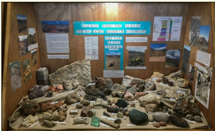
Shoshone Rock Club, Powell, Wyoming: 'Rockin' Thru the Ages in the Big Horn Basin of Wyoming.'