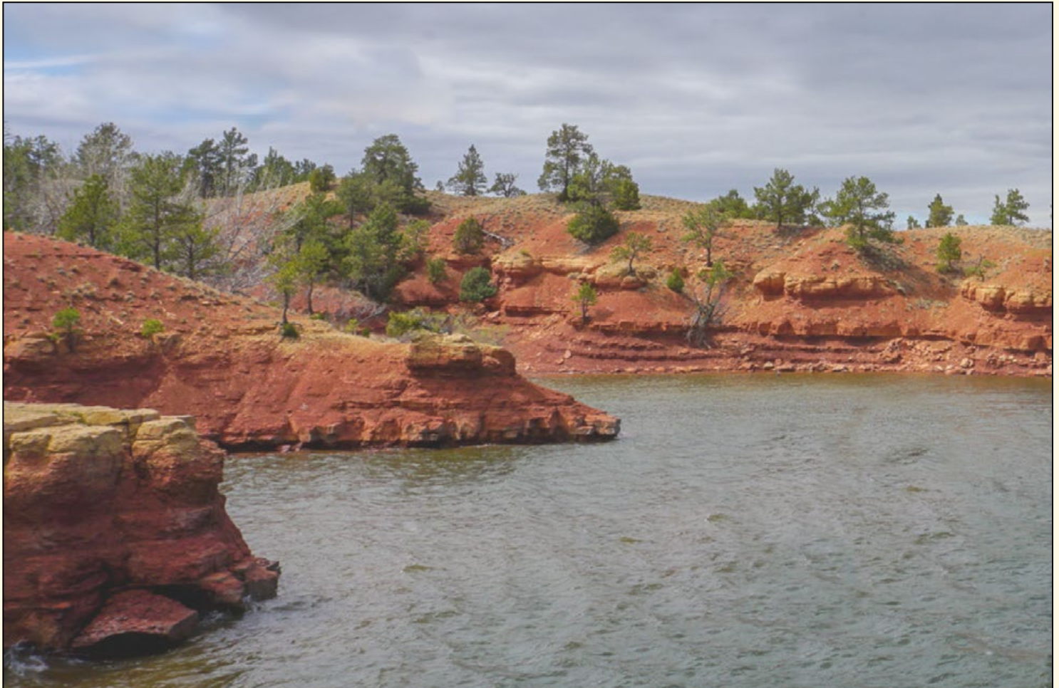
Glendo Reservoir, Glendo State Park

A publication of the Wyoming State Geological Survey